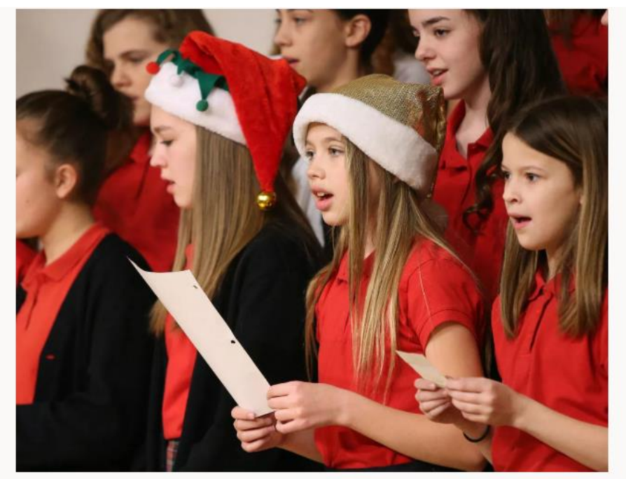
Eighth-graders sing Christmas carols at American Heritage School in American Fork on Thursday, Dec. 17, 2015.