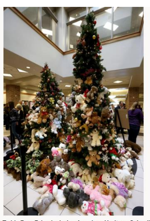
Bears decorate Christmas trees before the start of the Teddy Bear Brigade during American Heritage School's annual Teddy Bears for Christmas Service Project in American Fork on Thursday, Dec. 17, 2015. The project benefits homeless children at the Ogden Rescue Mission.