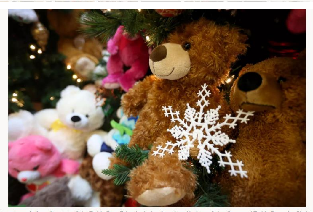
Bears decorate Christmas trees before the start of the Teddy Bear Brigade during American Heritage School's annual Teddy Bears for Christmas Service Project in American Fork on Thursday, Dec. 17, 2015. The project benefits homeless children at the Ogden Rescue Mission.