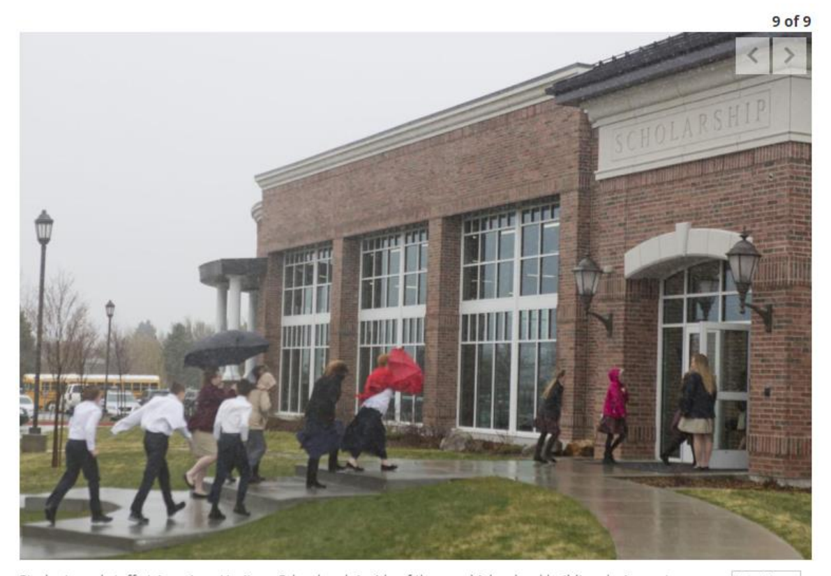
Students and staff at American Heritage School rush inside of the new high school building during a storm on Wednesday, April 10, 2019, in American Fork.