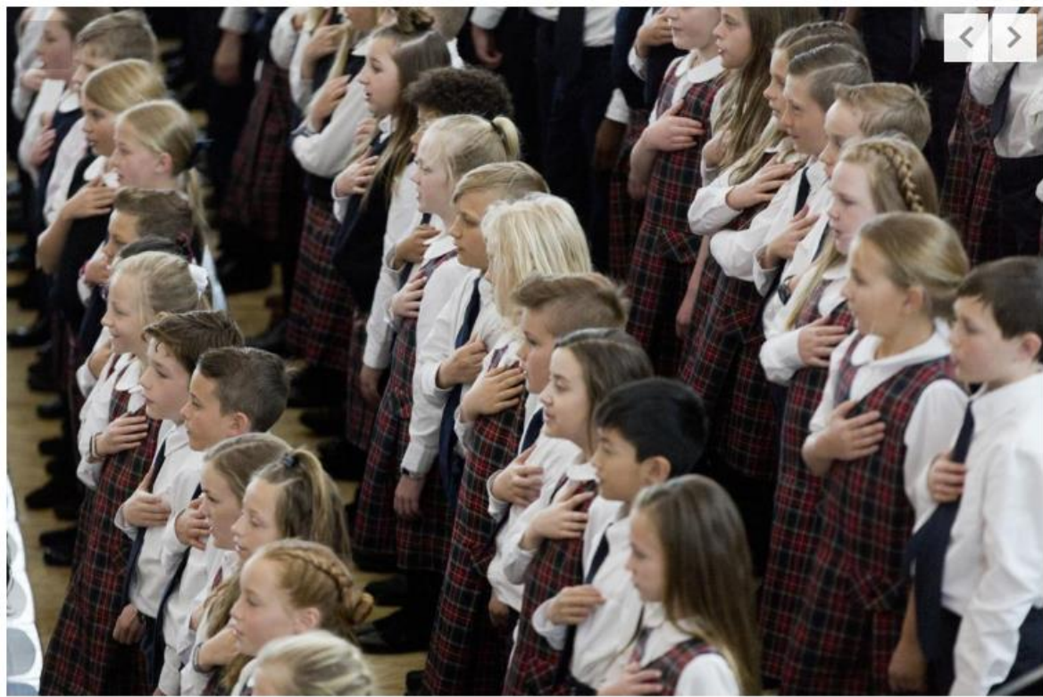
Students at American Heritage say the Pledge of Allegiance during the high school building and campus dedication ceremony on Wednesday, April 10, 2019, in American Fork.